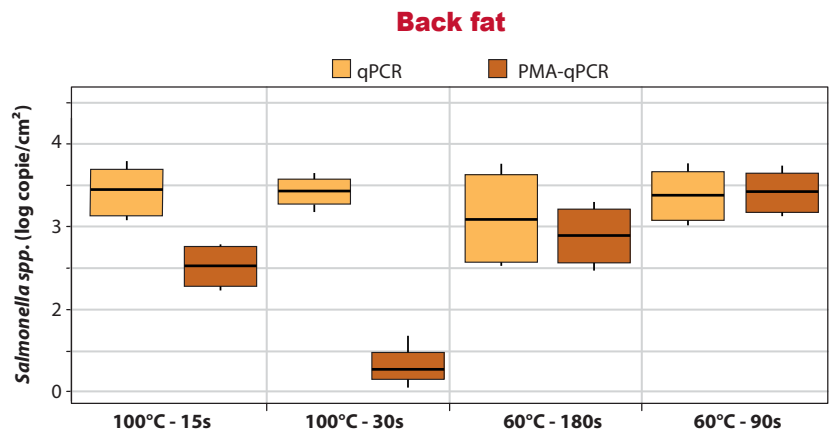
Figure 3: PMA-qPCR vs qPCR method with and without heat stress (60°C and 100°C) on artificially contaminated pork back fat